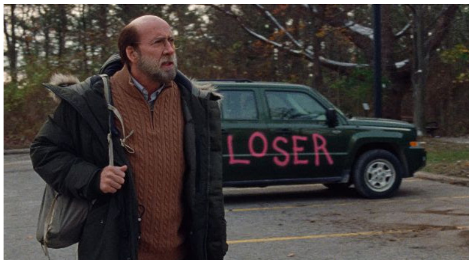
Dream Scenario (2023)